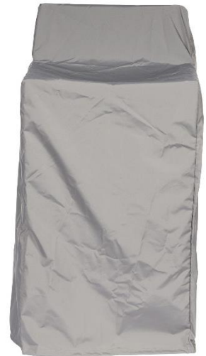
Cover for Equinox Armchair 4 Stacked (400905)

No, you can leave Barlow Tyrie furniture outdoors, uncovered, all year round. If you choose to cover your furniture during the winter you should use a material that allows wood to breathe. We make our furniture covers using WeatherMAX®, a modified high UV resistant polyester fabric that offers superior strength and durability. These covers are available from your Barlow Tyrie stockist.