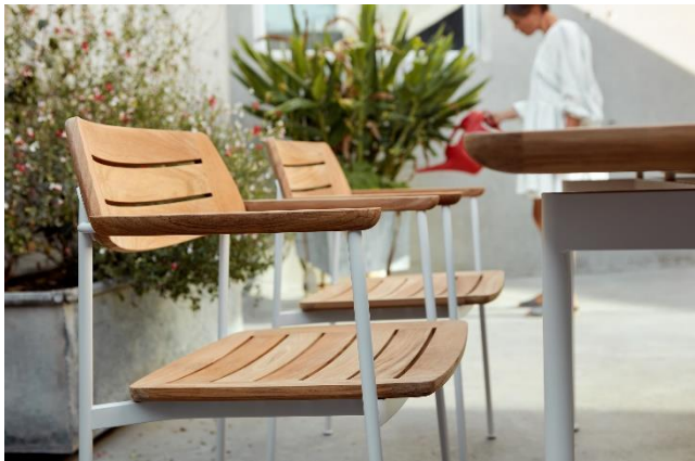
Layout Dining Armchair with a Powder Coated Stainless Steel frame in Arctic White and solid teak seat, arms and backrest

We make our furniture using 316 “marine grade” stainless steel, which will best withstand the rigours of an outdoor environment. We have added selected products to our Mercury and Equinox ranges that features an attractive powder-coat finish on the 316 stainless steel to give the ultimate protection in the harshest marine environment.