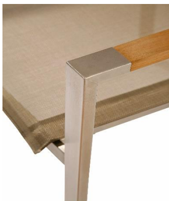
Mercury Armchair with a Stainless Steel Frame, solid teak arms and Titanium Sling (1MEA.502)

Conventional abrasive cleaners or strong acidic cleaners should never be used on stainless steel as this can damage the finish. Observing a regular maintenance and rinsing program will maintain the quality of the stainless steel finish for many years.