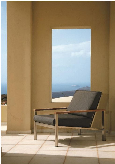
Equinox Deep Seating Armchair with 316 marine grade stainless steel frame, solid teak arms and Charcoal cushions (1EQDA.3705)

Before carrying out any repair to your Barlow Tyrie furniture, please read our terms, conditions and warranty.